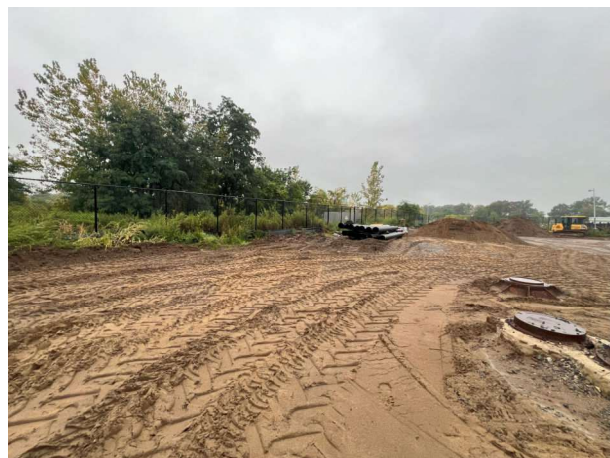
Pictures 3 & 4: Silt Fence - Northwest Corner and Along Western Edge of Site