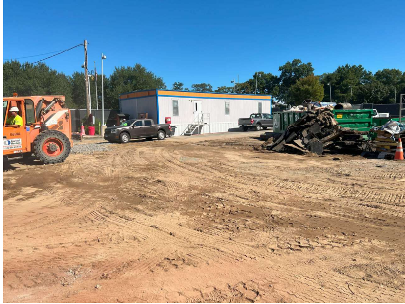
Picture 1: Construction Entrance Pad (Maintain & Extend as Necessary for Vehicle Traffic)