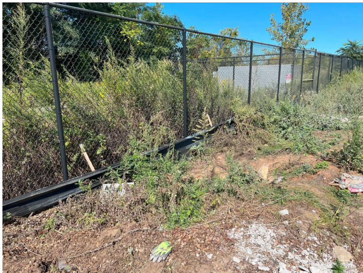
Picture 6: Silt Fence Under Repair at Time of Site Inspection - Along Western Fence Line