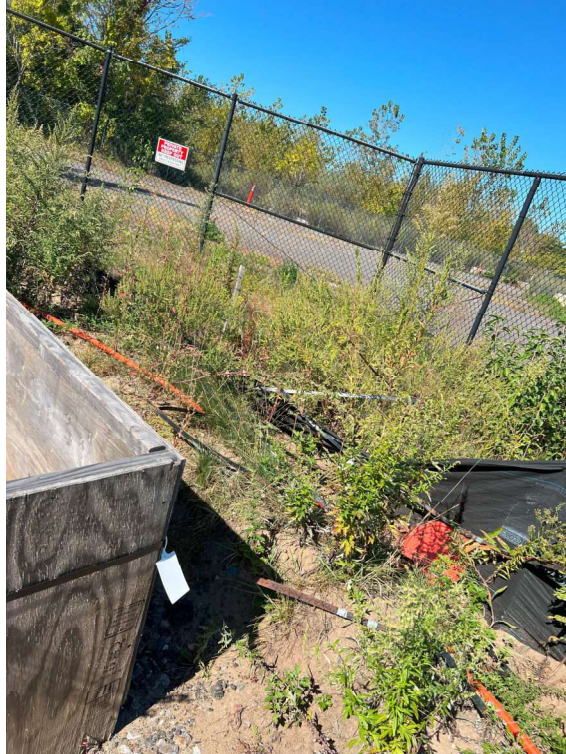
Picture 5: Silt Fence Under Repair at Time of Site Inspection - Northwest Corner of Site