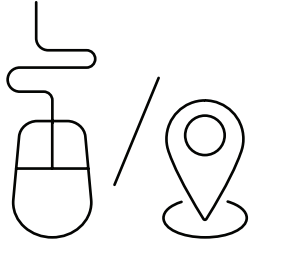
Online and In-Person Classes

To learn more, visit: goodwin.edu/continuing-ed